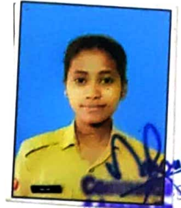
Officer 4 Assam Bn NCC Karimganj